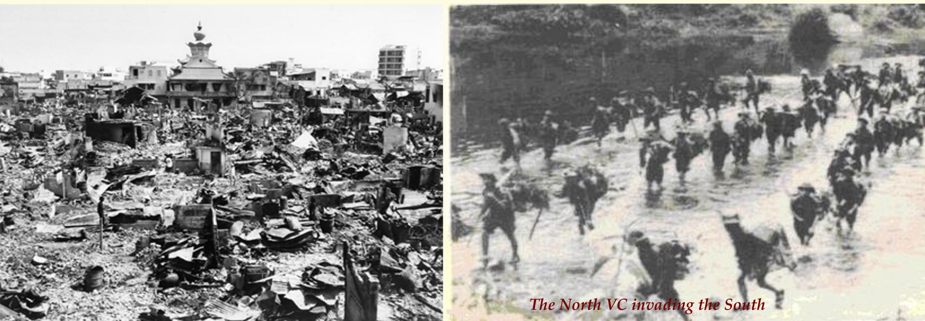
The North VC invading the South