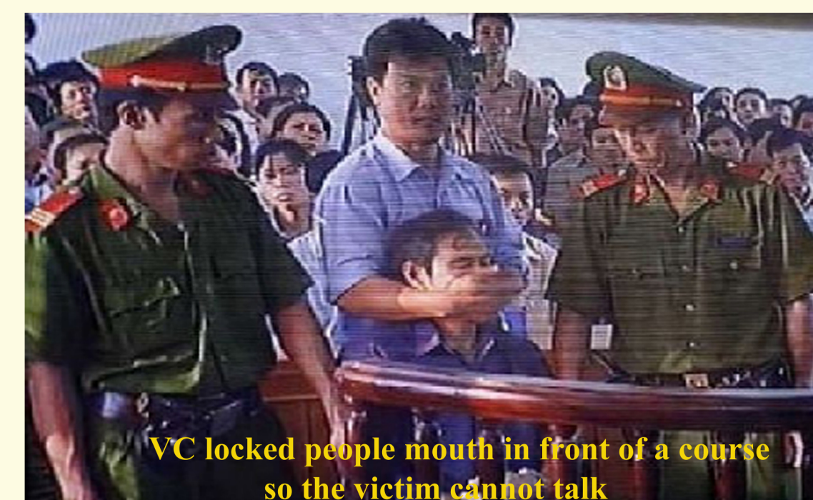
VC locked people mouth in front of a course so the victim can't talk