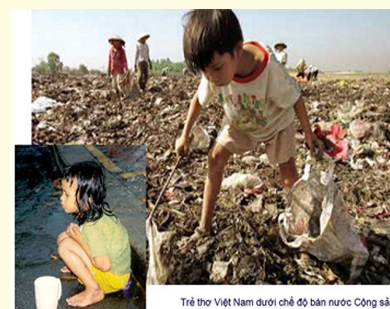
Trẻ thơ Việt Nam dưới chế độ bán nước Cộng sản