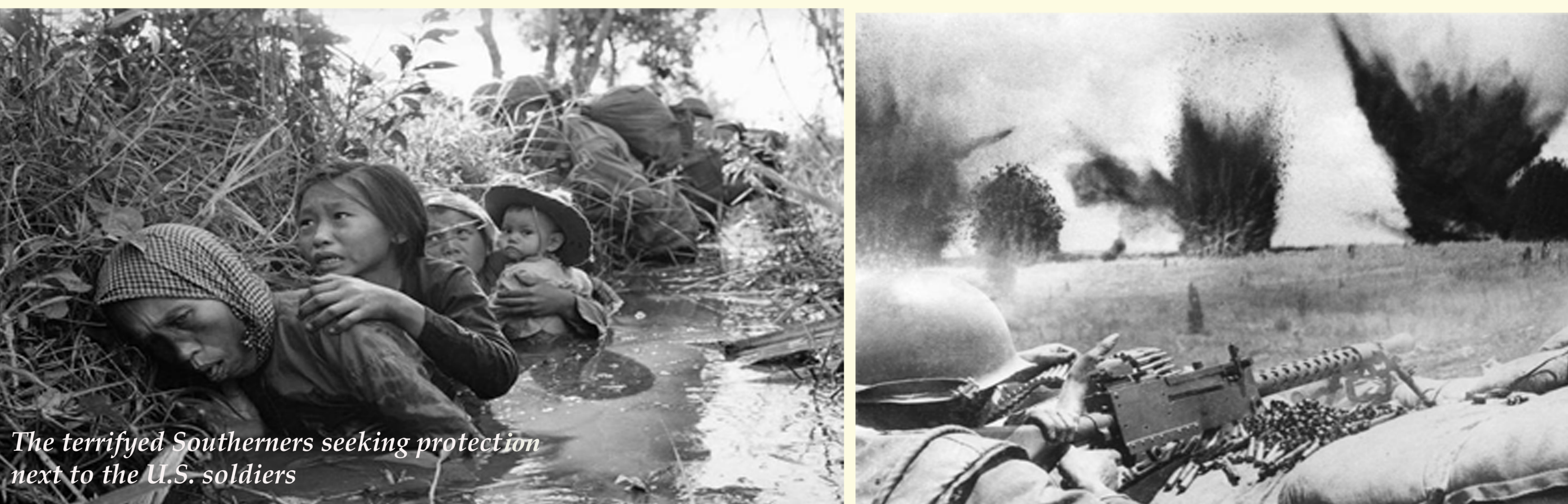
The terrified Southerners seeking protection next to the U.S. soldiers