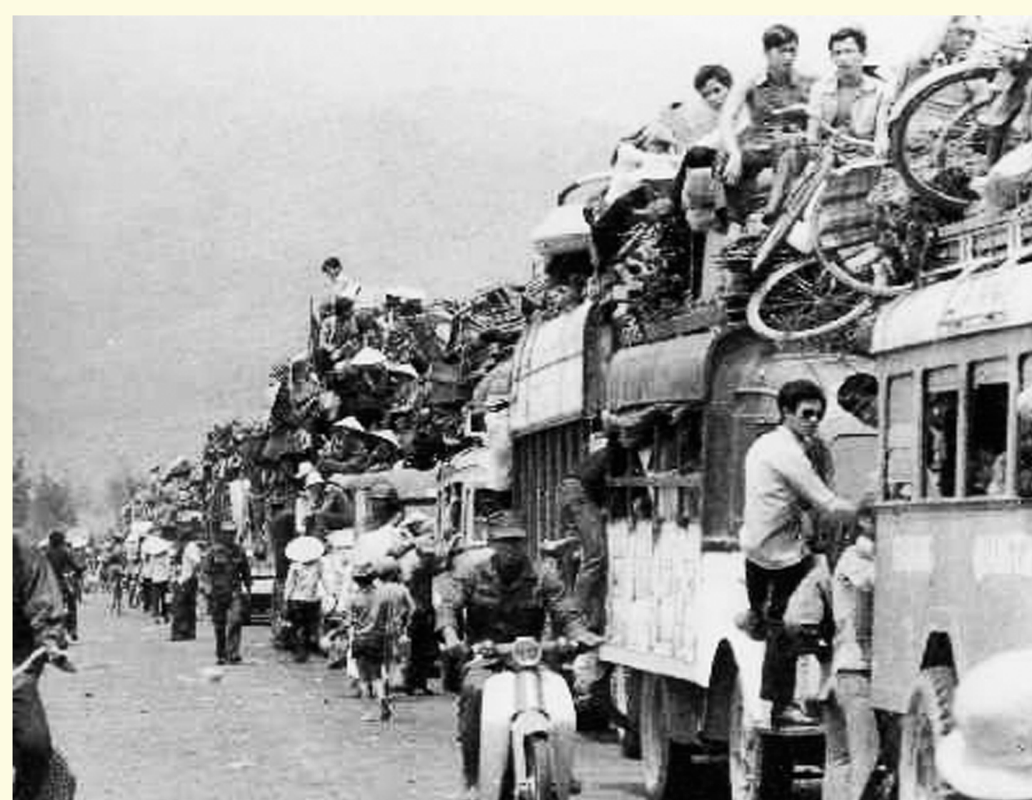
The Southerners running away when the VC came.