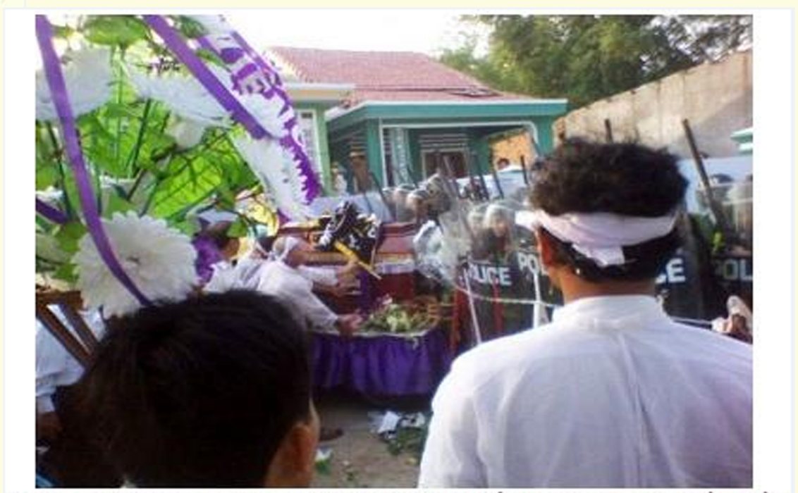
Công an CSVN cướp quan tài và đánh chết người giáo xứ Côn Dầu